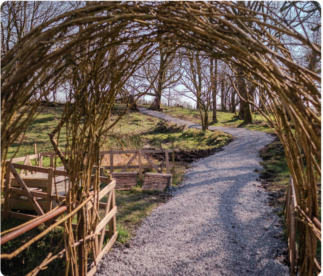
THE WILLOW WALK – FORTY-ONE ACRES TO WANDER BETWEEN THE SCENES

For the friends who'd pick stars over ceilings: a Mongolian yurt, a canopy tent and the twelve-bunk Safari Bunk House, tucked into the grounds a short stroll from the music, with a shared shower and bathroom block close by.